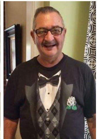
Overdressed & Proud!